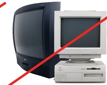
TELEVISIONS, COMPUTERS, OR MONITORS