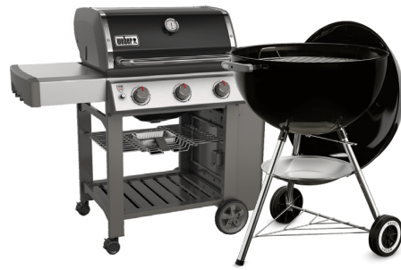
BARBECUES (PROPANE TANKS AND CHARCOAL MUST BE REMOVED)