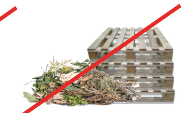
YARD WASTE OR WOODEN PALLET