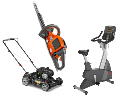
YARD AND EXERCISE EQUIPMENT (NO RIDING MOWERS) (REMOVE ALL FLUID AND BATTERIES)