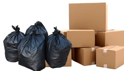
UP TO 15 BAGS OR BOXES HOUSEHOLD ITEMS (NO GARBAGE, SMALL TO MEDIUM SIZED) (MUST BE LIGHT ENOUGH TO LIFT)