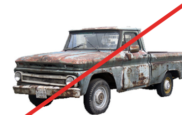
CARS OR OTHER VEHICLES