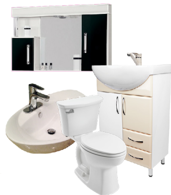
KITCHEN AND BATH ITEMS