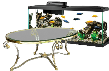
LARGE GLASS ITEMS (NO BROKEN GLASS) (ALL ITEMS MUST BE EMPTY)