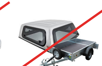
TRAILERS OR CANOPIES