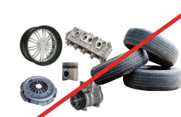
TIRES OR VEHICLE PARTS