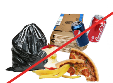
HOUSEHOLD GARBAGE, RECYCLING, FOOD, OR LIQUIDS

These items are NOT accepted for curbside Call-2-Haul pickup. For more information, visit cityoftacoma.org/call2haul .