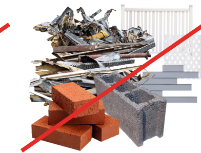
BUILDING MATERIALS, FENCING, OR ROOFING