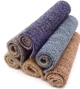
ROLLED CARPET (MAXIMUM OF 6 ROLLS PER HAUL 6 FT. IN LENGTH, 1 FT. DIAMETER)