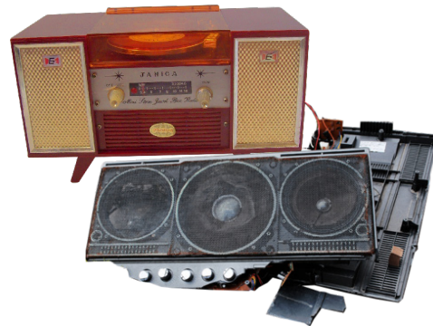
SOME ELECTRONICS (NO TELEVISIONS OR MONITORS)