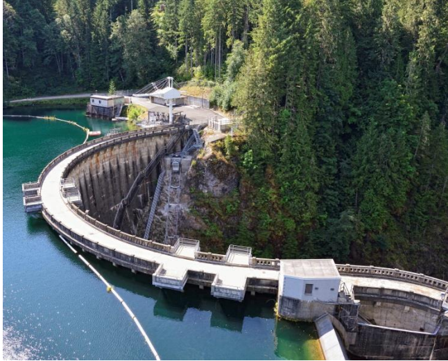
New Powerhouse and upstream fish capture structure

PW10-0473F - Tacoma Power Cushman Dam #2, Fish Collection/Sorting Facility & North Fork Skokomish Powerhouse –“Initiative 937” Renewable Energy Credit (REC) LEAP Utilization Goal – 15% Apprenticeship. Goal met.