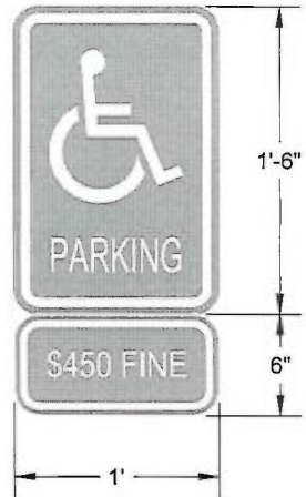
DISABILITY PARKING STALL SIGNS (WHITE ON BLUE)

REVIEWED BY DCS PUBLIC WORKS ENVIRONMENTAL SERVICES TACOMA POWER TACOMA WATER