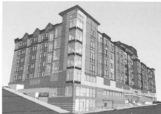
FIG. 5-3 A conceptual drawing of the Metropolitan Towers III project; view looking north from 4th and Broadway.

Tacoma presently needs approximately an additional 14,096 affordable housing units for its present