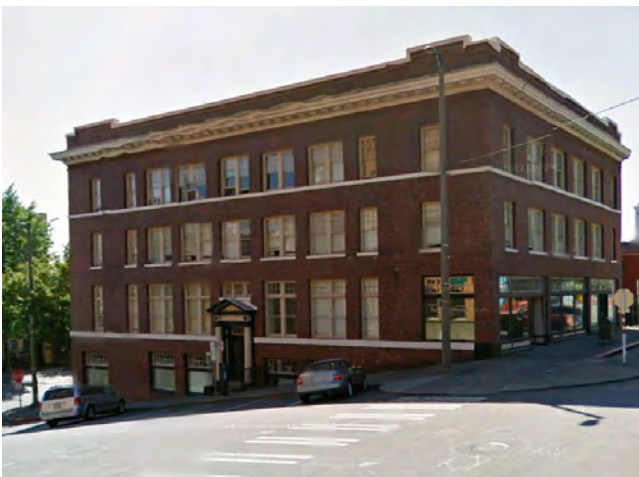
FIG. 5-5 The Colonial Apartments at 701 Commerce Street.

population of low-income households who are paying unaffordable amounts for housing. To accommodate the additional households Tacoma expects between now and 2030, Tacoma will require an additional 8,174 affordable units.