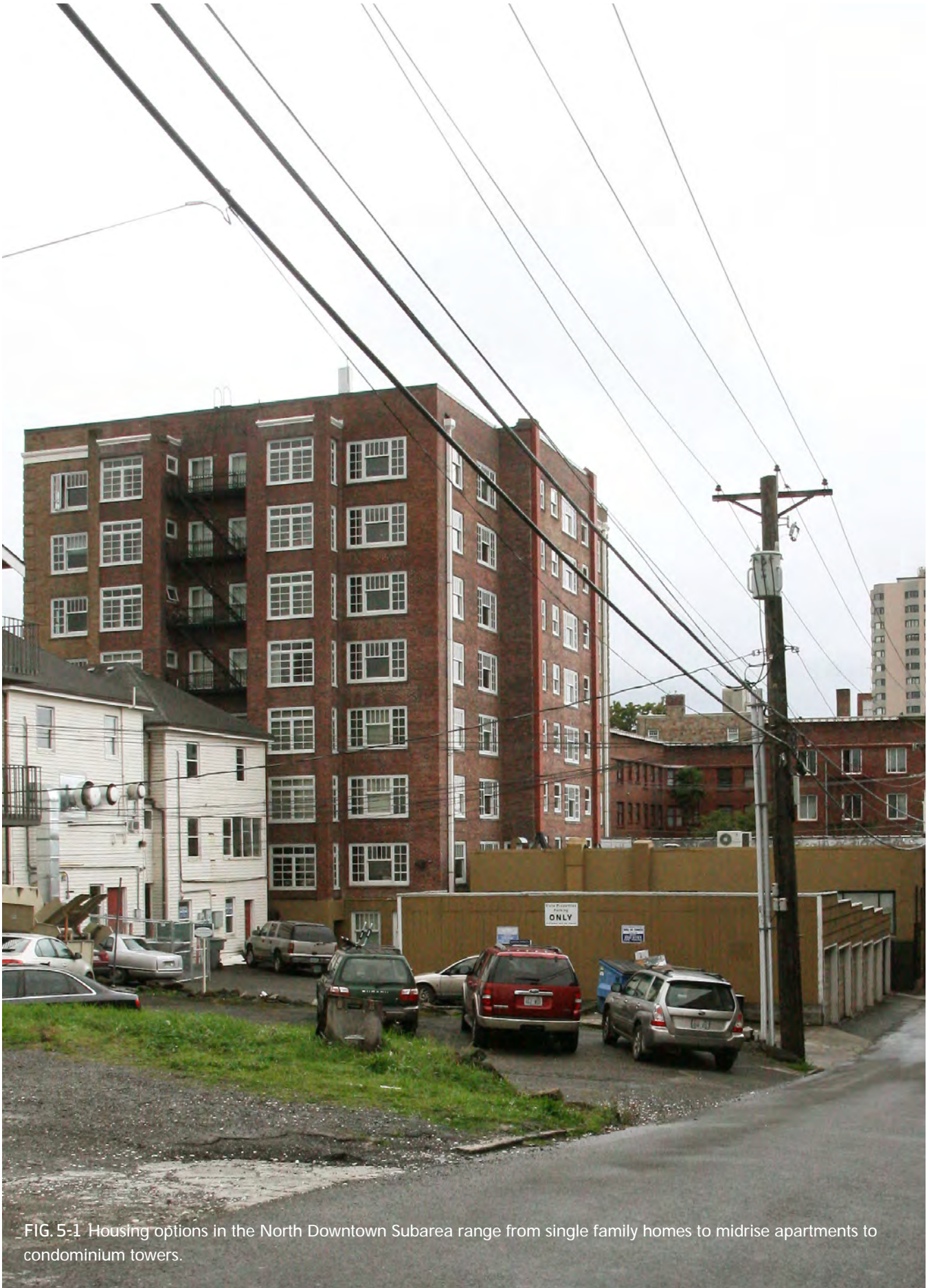
FIG. 5-1 Housing options in the North Downtown Subarea range from single family homes to midrise apartments to condominium towers.