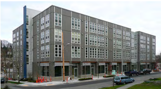
FIG. 5-1 The Hiawatha Lofts development in Seattle provides subsidized affordable housing for artists.