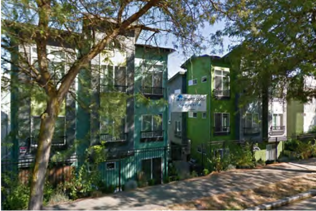
FIG. 5-1 Microhousing developments (sometimes as “apodments”), such as the Videre in Seattle’s Capitol Hill neighborhood, provide tenants with a smaller, lower-cost alternative to typical rental units.