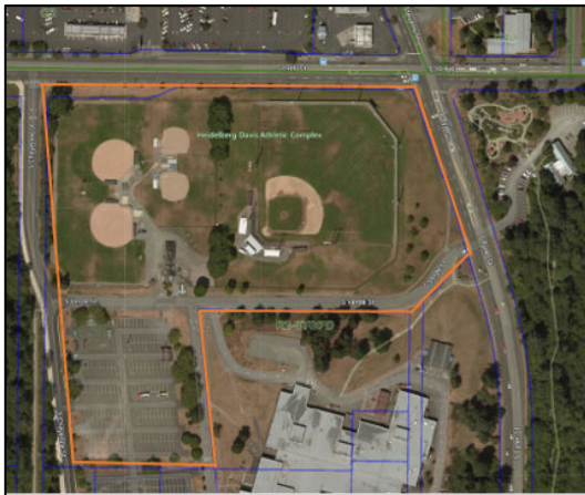
Figure 1. Heidelberg-Davis Site (S. 19th St. & S. Tyler St.)

Proposed by the Planning and Development Services Department and the Public Works Department, this application compiles 35 minor and non-policy amendments to the One Tacoma Comprehensive Plan and the Land Use Regulatory Code, intended to update information, correct errors, address inconsistencies, improve clarity, and enhance applicability of the Plan and the Code.