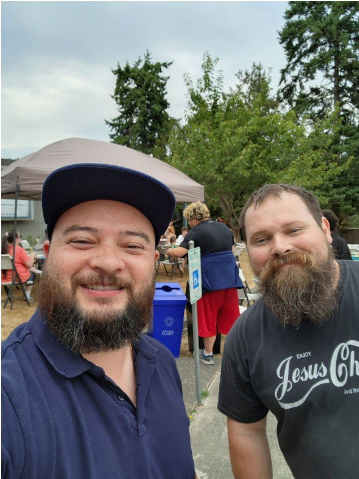
I joined with the Larchmont and Blue Berry Park neighborhoods for a National night out!