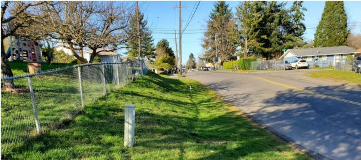
Pictured: An example of incomplete sidewalks on South Sheridan Street in Tacoma.

Complete Streets is a nationally recognized term referring to streets and sidewalks that are designed, operated and maintained to enable safe and convenient access and travel for all users – pedestrians, bicyclists, transit riders, and people of all ages and abilities, as well as freight and motor vehicle drivers. Complete Streets also foster a sense of place in the public realm and incorporate green features including trees, landscaping and, in some cases, low impact development stormwater features.