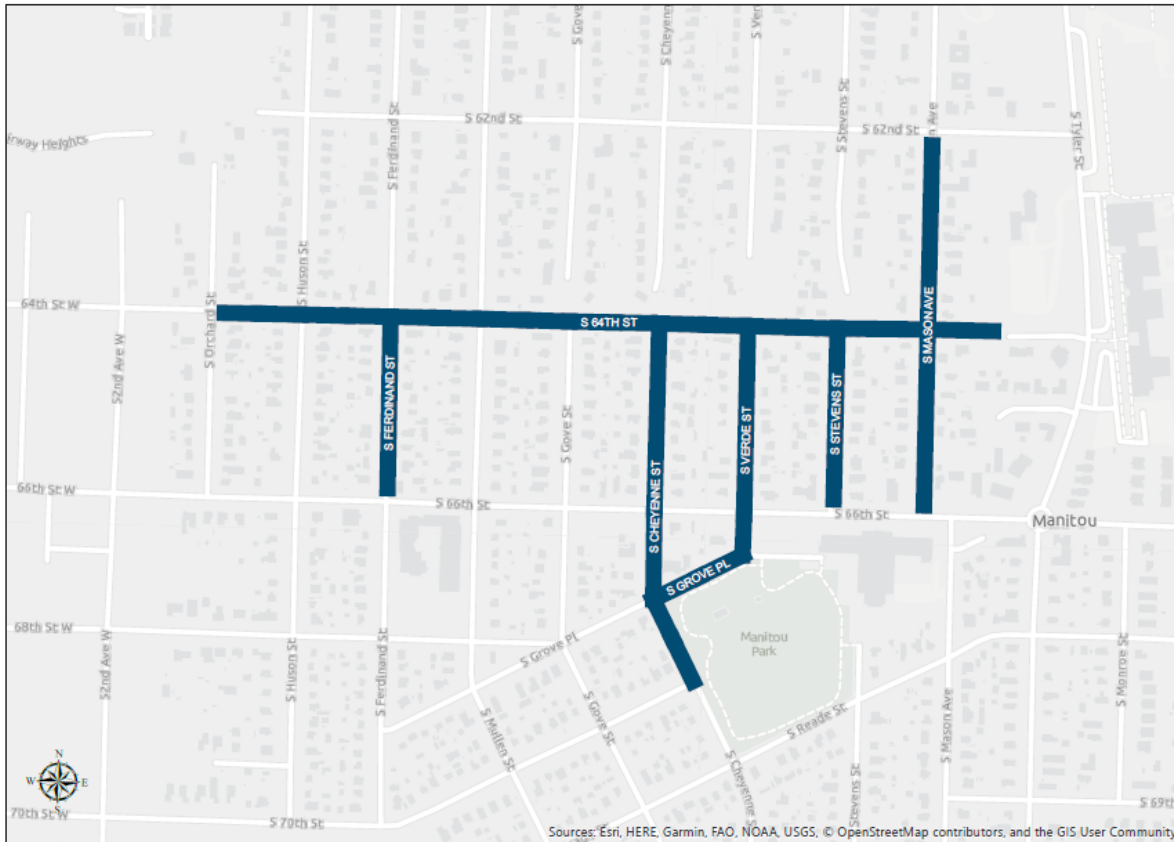
Pictured: a map of where the Manitou Green Infrastructure Project will improve approximately 24 Blocks of residential streets near S 66th Street & S Tyler Street.