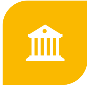
Public Programming at Facility