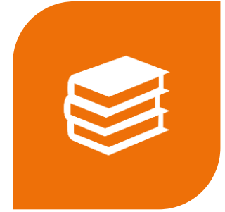
Programming in Schools