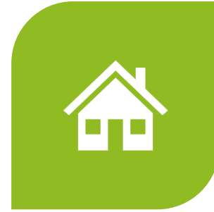
Programming in Neighborhoods