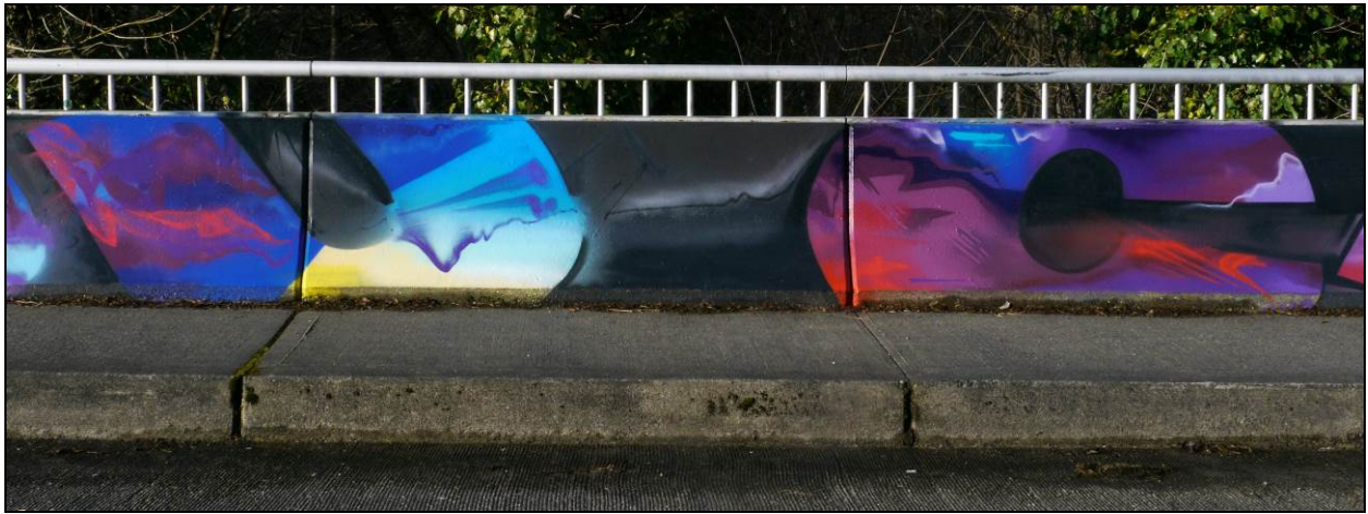
No One Else But You Can Feel Along the Grooves , 2013 East 43 rd Street Bridge Mural, 310 E. 43 rd Street Aerosol and latex on concrete, 30' x 176' Artist: David Long

No One Else But You Can Feel Along the Grooves is the second mural to cover the East 43 rd Street Bridge. The site is the intersection of two active pathways: E. 43 rd Street, which connects the Eastside of Tacoma to Pacific Avenue, and spans above a strip of railroad tracks, which is traveled more often by pedestrians than by freight trains. The surrounding neighborhood is a diverse community of many languages, experiences and perspectives; this intersection is a point of exposure between differing walks of life.