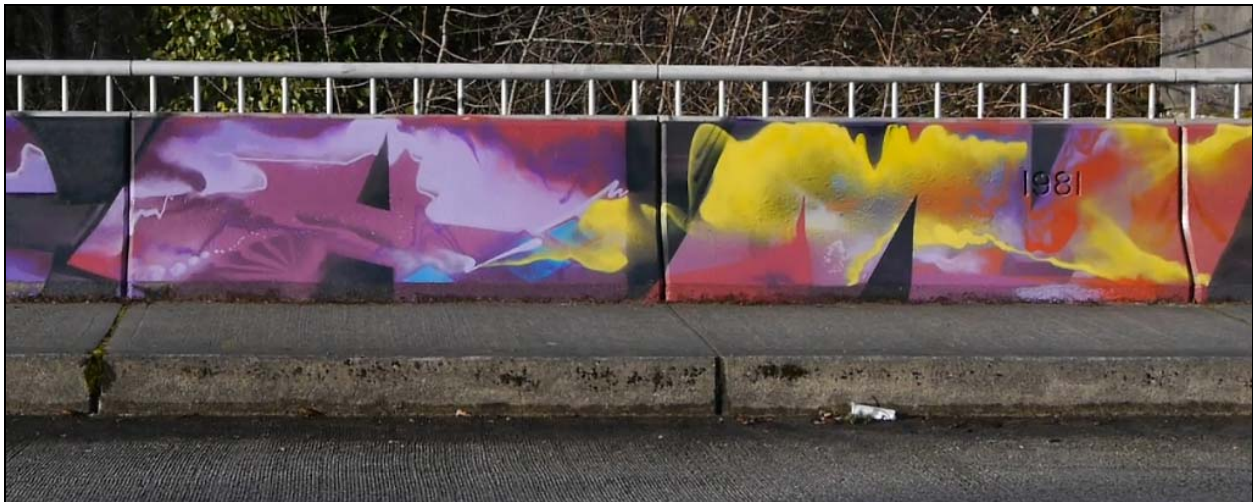
No One Else But You Can Feel Along the Grooves , 2013 East 43 rd Street Bridge Mural, 310 E. 43 rd Street Aerosol and latex on concrete, 30" x 176" Artist: David Long