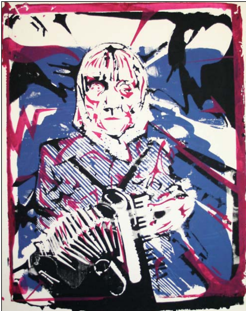
Portrait of a Subway Musician , 2011 Screenprint using contact paper, 26" x 20"