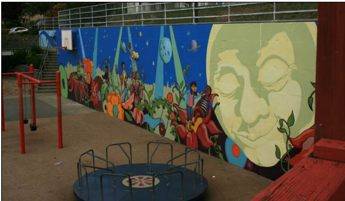
Bergerson Terrace mural, 2011