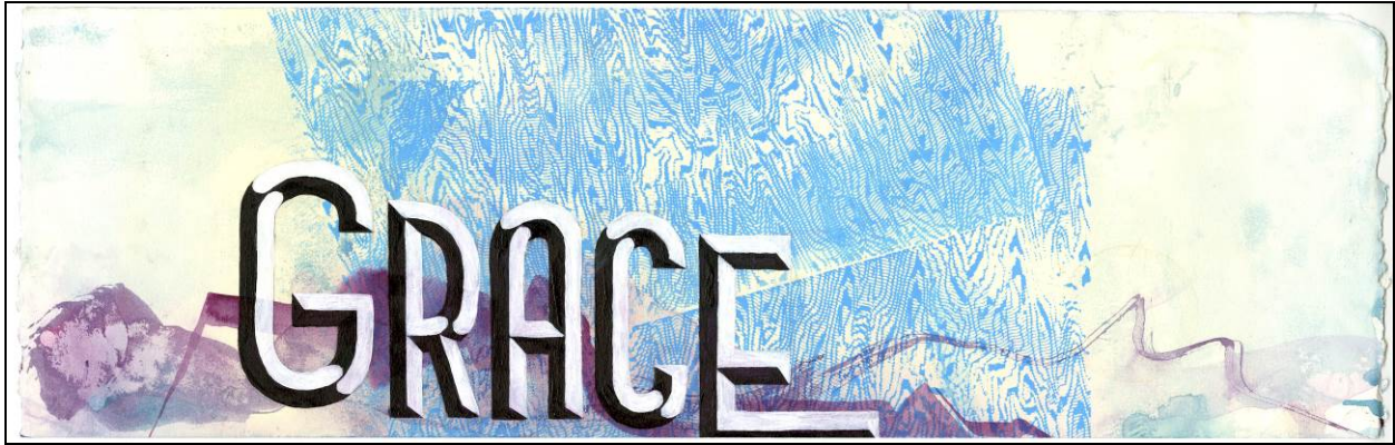
Grace , 2014 Monotype screen print, watercolor, and acrylic on paper, 7" x 22"