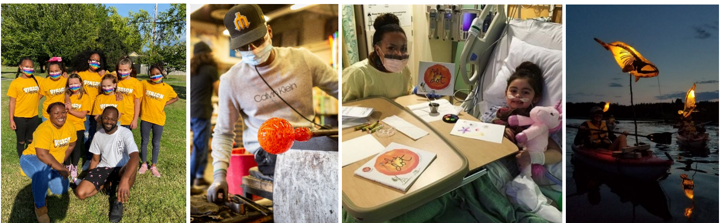
Previously funded projects have included (left to right): WayOut Kids' STEAM-themed educational videos; Hilltop Artists and partners for the Monkeyshines Project; Greentrike's art-based Care Kits; and arts programming for Tacoma Ocean Fest.

Organizations selected for funding will be required to sign a contract for services, which lays out the amount of funding the organization will receive and the public benefit that the organization will provide. The full amount of funding will not be paid up front. Funding will be broken into several payment phases spread out over the term of the funding contract. Organizations will receive final payment after all services have been provided and a final report has been submitted. Organizations should be prepared to cover the costs of their project until that time, but the City will work with each awardee to stagger payment phases to lessen financial strain.