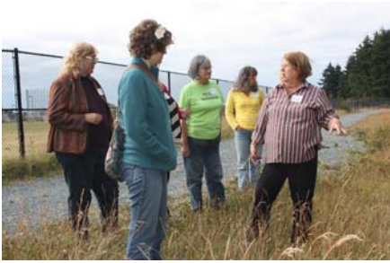
First Creek stakeholders tour 2011