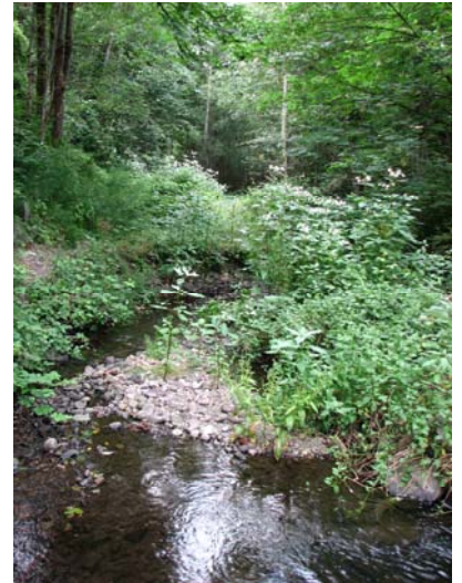
Lower reach of First Creek