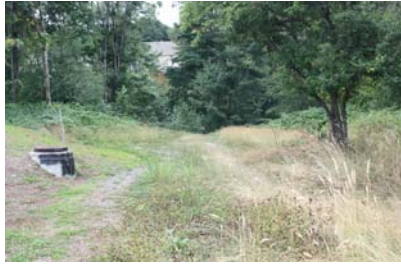
Stormwater infrastructure within First Creek