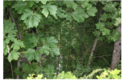
Native Big Leaf Maple, Acer macrophyllum