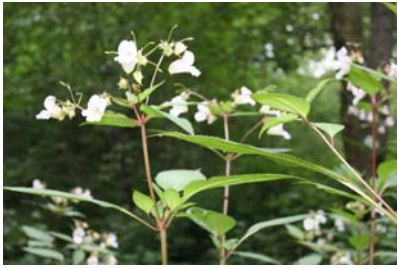
Invasive Species: Policeman's Helmet, Impatiens glandulifera

This plan provides a resource that is meant to guide the efforts of all agencies, neighbors, stewards, businesses and members of the greater community with an interest in improving conditions in the First Creek Watershed.