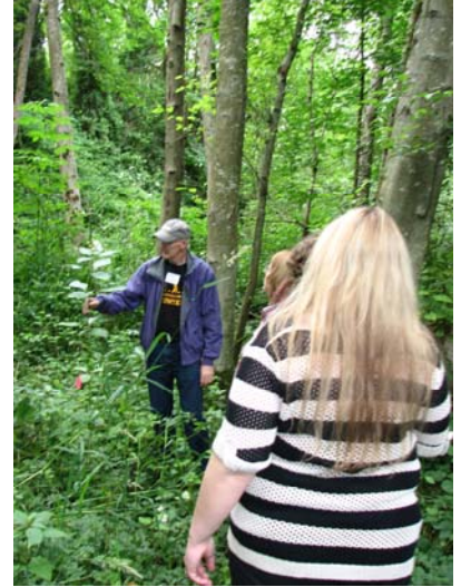
First Creek steward educating visitors about local flora

While the community vision and objectives for First Creek (presented on page 5) reflect a desired future state and direction for action that is shared among those who participated in plan development, different organizations and individuals may have different priorities for improving the creek and the watershed. For this reason, action items have not been assigned a level of priority (with the exception of a short list "first steps" and highest priority actions listed in Section VI of this plan). Instead, to help the City and community determine which activities to focus on, each action has been identified as one or more of the following: