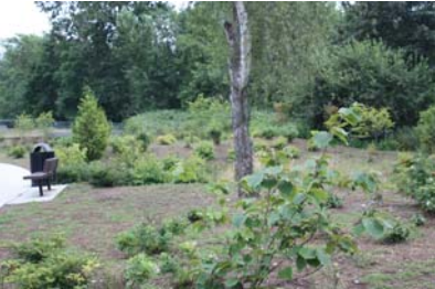
Top – First Creek stakeholders tour 2011