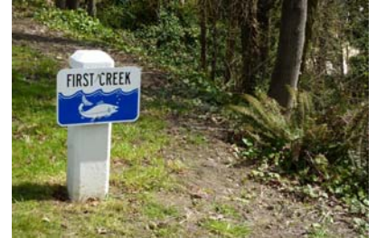
Creek identification signs installed at Fairbanks Street

This plan is not just the City's, the Tribe's or Tacoma Housing Authority's plan – it is a shared vision for how all the stakeholders can contribute to achieving the collaborative vision. It is structured so that individual stakeholders can take actions, knowing that they fit into a shared vision. The plan and its actions should be reviewed collaboratively and updated as needed to keep pace with progress and changing needs.