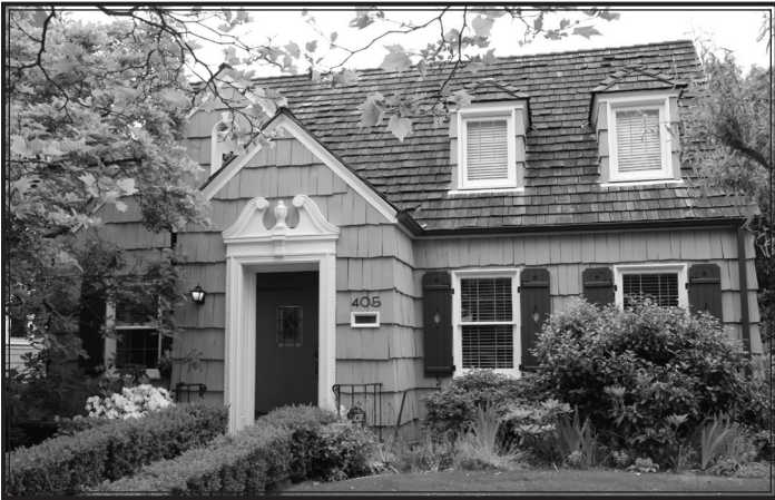
405 South Sheridan Avenue