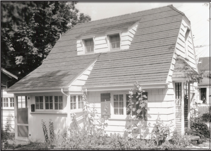
407 South Sheridan Avenue •