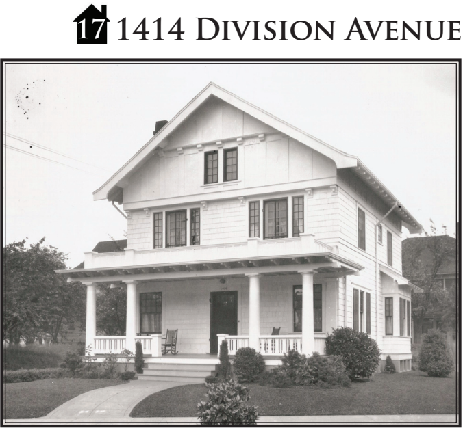
Tacoma Public Library, BU-10043

This impressive home was built in 1909 for William A. Taylor, a local newspaper pressman. The residence has predominately Craftsman details with the broad gable end, exposed rafter tails and basic rectangular shape. The shingled walls and half timbering in the gable end are common for the style. However, this rather elaborate example of the style showcases Classical porch columns, and unusual design feature. The multi-light upper window sashes on the main floor and the multi-lights on all second floor windows are another uncommon feature for this style, and would have been more commonly found in Colonial Revival homes.