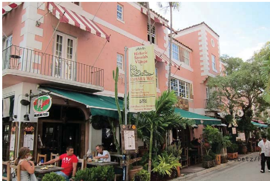
Española Way in Miami's South Beach.

3. Local districts encourage better quality design. In this case, better design equals a greater sense of cohesiveness, more innovative use of materials, and greater public appeal—all of which are shown to occur more often within designated districts than non-designated ones.