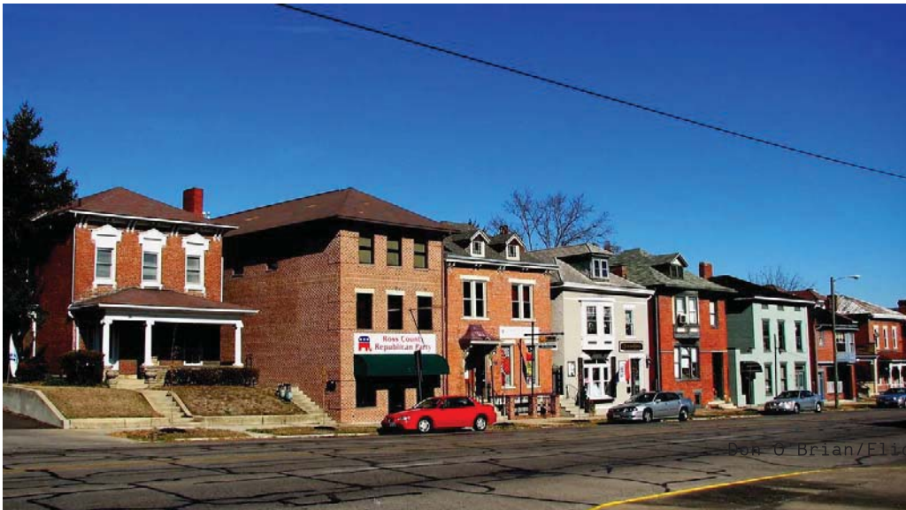
Main Street, Chillicothe, Ohio

7. Historic districts can positively impact the local economy through tourism. An aesthetically cohesive and well-promoted district can be a community's most important attraction. According to a 2009 report, 78% of all U.S. leisure travelers are cultural and/or heritage travelers who spent, on average, $994 on their most recent trips—compared to $611 spent by non-cultural and heritage travelers.