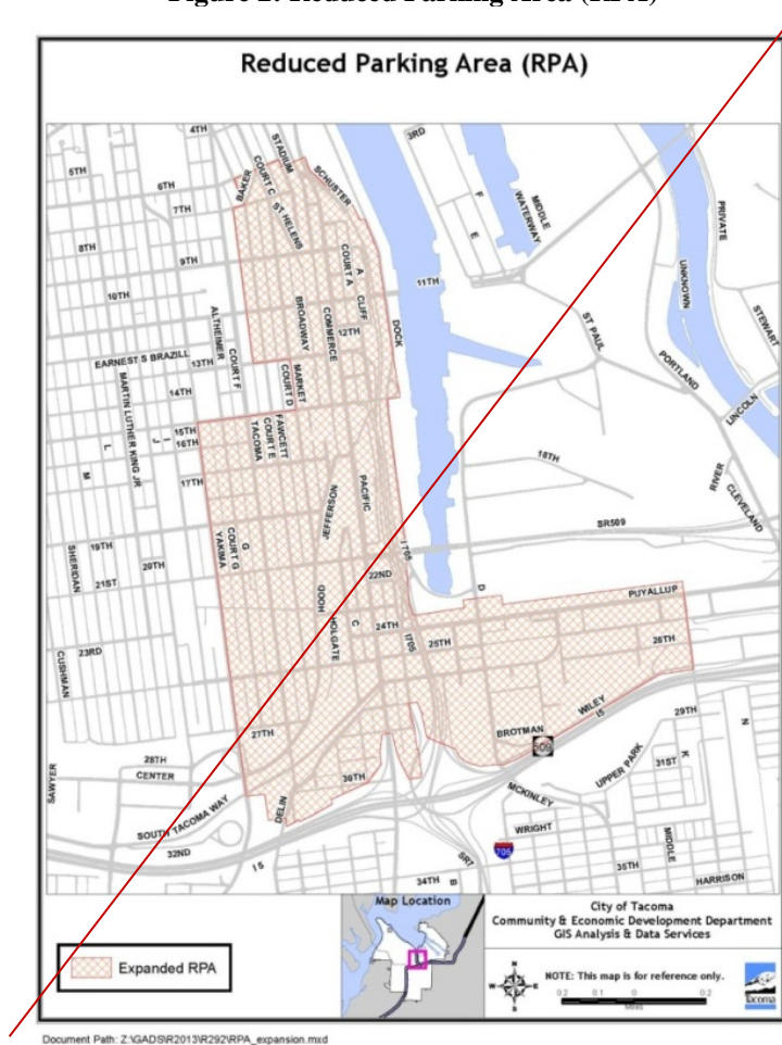
Figure 2: Reduced Parking Area (RPA)

1. Minimum off-street parking stall quantity requirements do not apply within the Reduced Parking Area (RPA), which is located generally between 6th Avenue and South 23rd Street, and between Dock Street and Tacoma Avenue (the specific boundary of the area is shown in Figure 2, below).