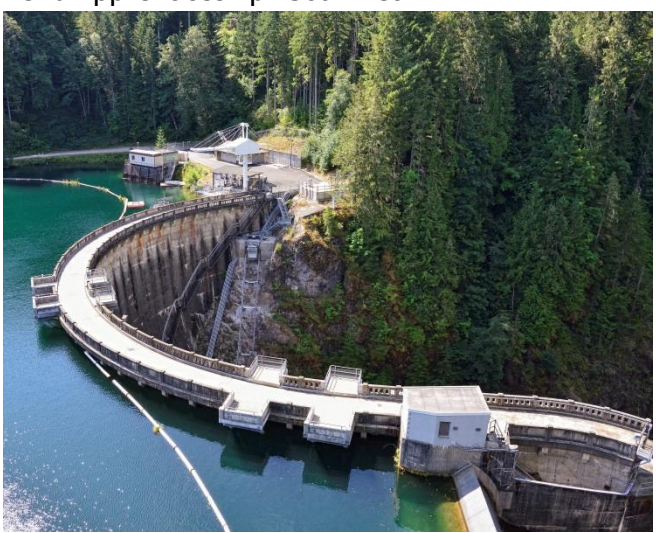
New Powerhouse and upstream fish capture structure

PW10-0473F - Tacoma Power Cushman Dam #2, Fish Collection/Sorting Facility & North Fork Skokomish Powerhouse –"Initiative 937" Renewable Energy Credit (REC) LEAP Utilization Goal – 15% Apprenticeship. Goal met.