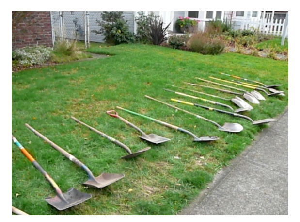
Shovels ready to plant trees.

Proper planting, care and maintenance are necessary to ensure that objectives set forth in this element are met and to sustain or enhance the quality of life in the built environment for Tacoma now and in the future. In addition, trees can be used to accomplish other land use goals and should be a significant part of Tacoma's visual identity, contributing to a special "sense of place" within the Pacific Northwest and bringing a sense of natural beauty to the built environment. Planting and protecting trees in Tacoma will help to maintain strong and healthy neighborhoods and business districts by enhancing Tacoma's identity and civic pride.