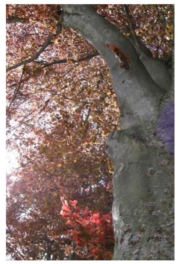
Copper Beech at Wright Park

The City of Tacoma takes the lead in establishing a citywide tree canopy cover of 30 per cent by the year 2030 ("30-by-30") through effective education, extensive outreach, innovative partnerships and pragmatic implementation strategies.