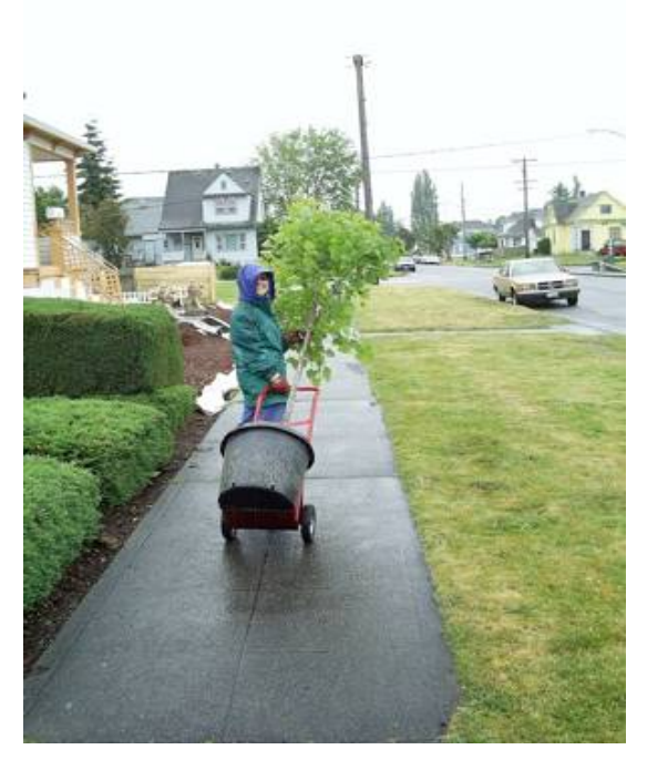
A property owner is moving a tree during a neighborhood group planting.

Develop demonstration projects, in diverse areas representative of the range of land use and development patterns in the City, implementing outreach and education strategies targeted toward achieving the City's tree canopy goal. Implementation of the demonstration projects should be a high priority in the Urban Forest Management Plan. Learn from what works and implement effective strategies citywide.