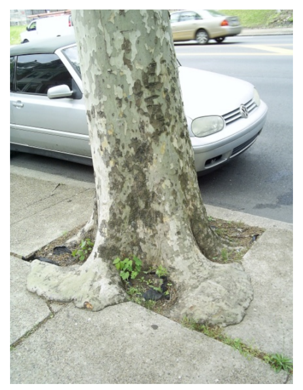
A tree that has overgrown the rooting space it was given.

Design streets, sidewalks and other infrastructure with thorough consideration of trees during the planning, design and construction processes.