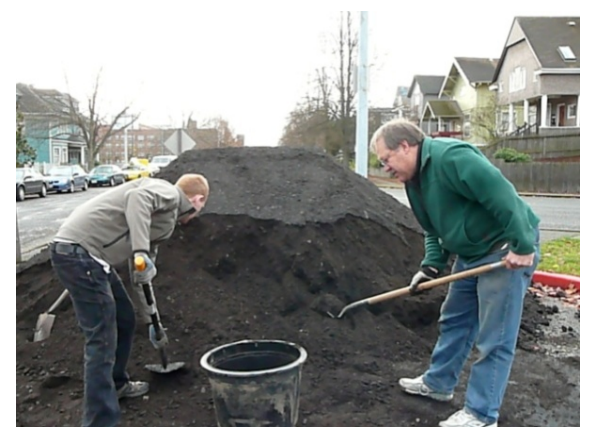
South Yakima and 6th Ave planting project 2008

goal are strategies of urban forestry that meet sustainability goals there are also other ways to increase the sustainability of our urban forest. This section is intended to address those methods.