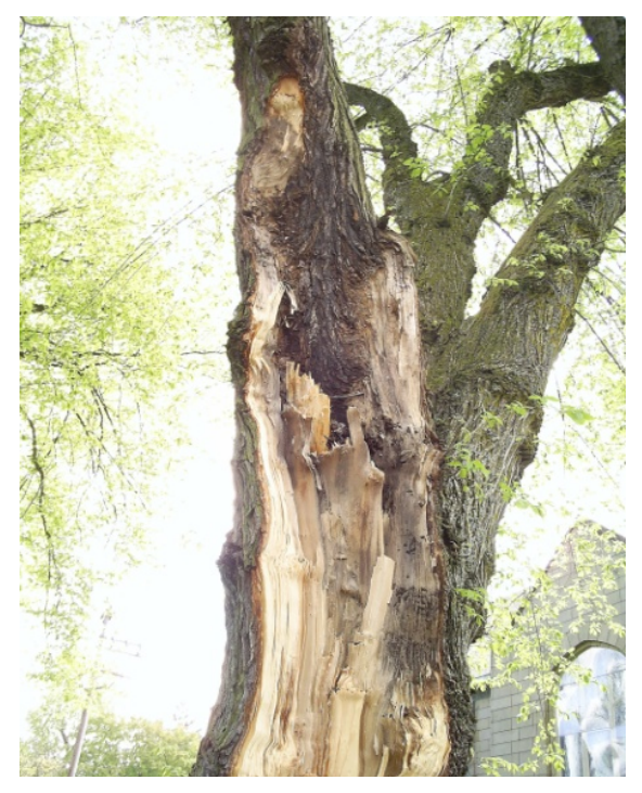
A severely damaged tree before removal

UF-REM-2 Existing Trees on City Land Retain as many mature trees as practicable and appropriate during development of City owned land.