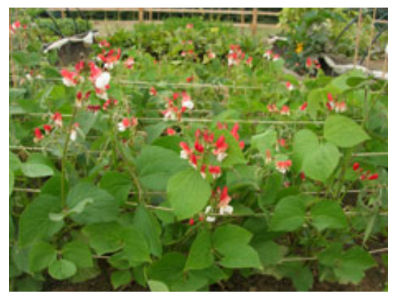
Colorful bean flowers in a raised bed garden