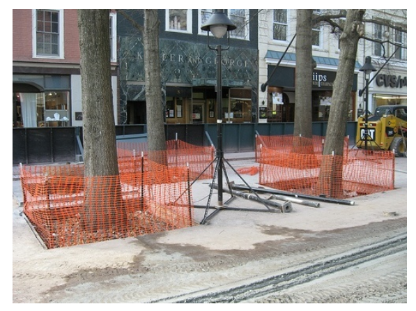
Fencing used around trees to help protect them through construction.