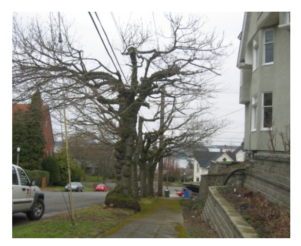
Inappropriate trees under power lines

Develop standards and educate the public about appropriate species when planting under overhead utilities, over underground utilities and adjacent to streets to reduce future conflicts.