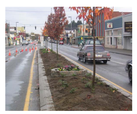
South Tacoma Way Median

Medians that are planted within the City on public streets, unless otherwise designated, shall typically be the responsibility of the City of Tacoma to maintain. Medians may be used for natural drainage systems to manage stormwater or landscaping. Where there are safety concerns, medians should not be used for community gardens.