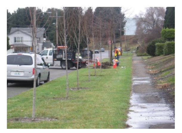
New trees at S 23rd and S Alaska St