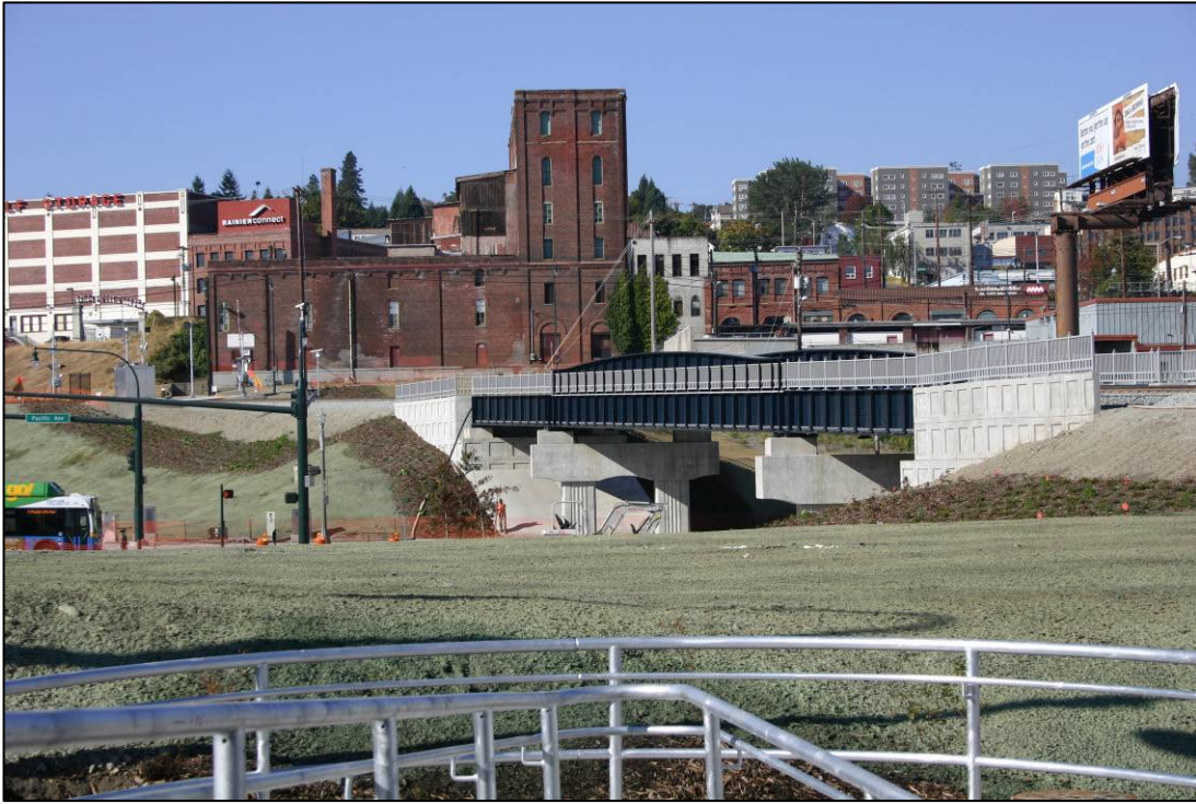
View of the Pacific Avenue Underpass from the 'A' Street Passageway, facing west toward the Brewery District.