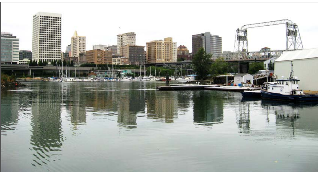
View of downtown Tacoma, facing west, from the Foss Waterway and including the historic Murray Morgan Bridge on the right, which connects downtown Tacoma to the Port of Tacoma. Dome District, Brewery District, and Pacific Avenue Underpass lie to the south of this area.