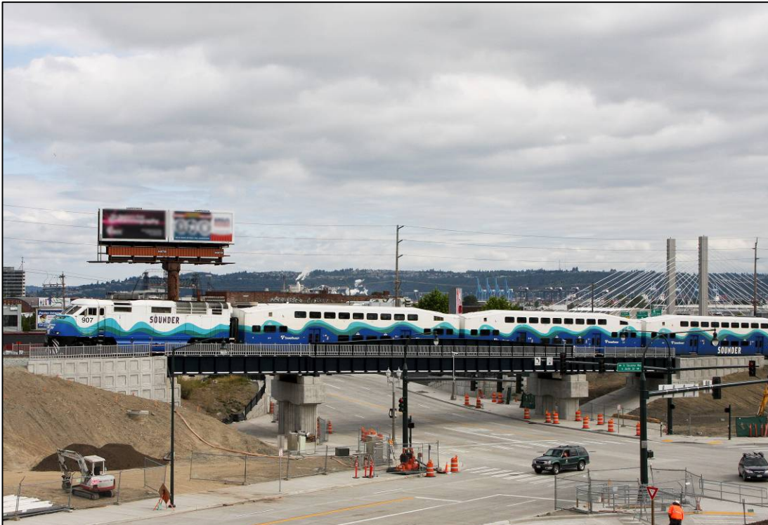
Sounder Commuter Rail on the Pacific Avenue Bridge, indicating the possible views from the train.