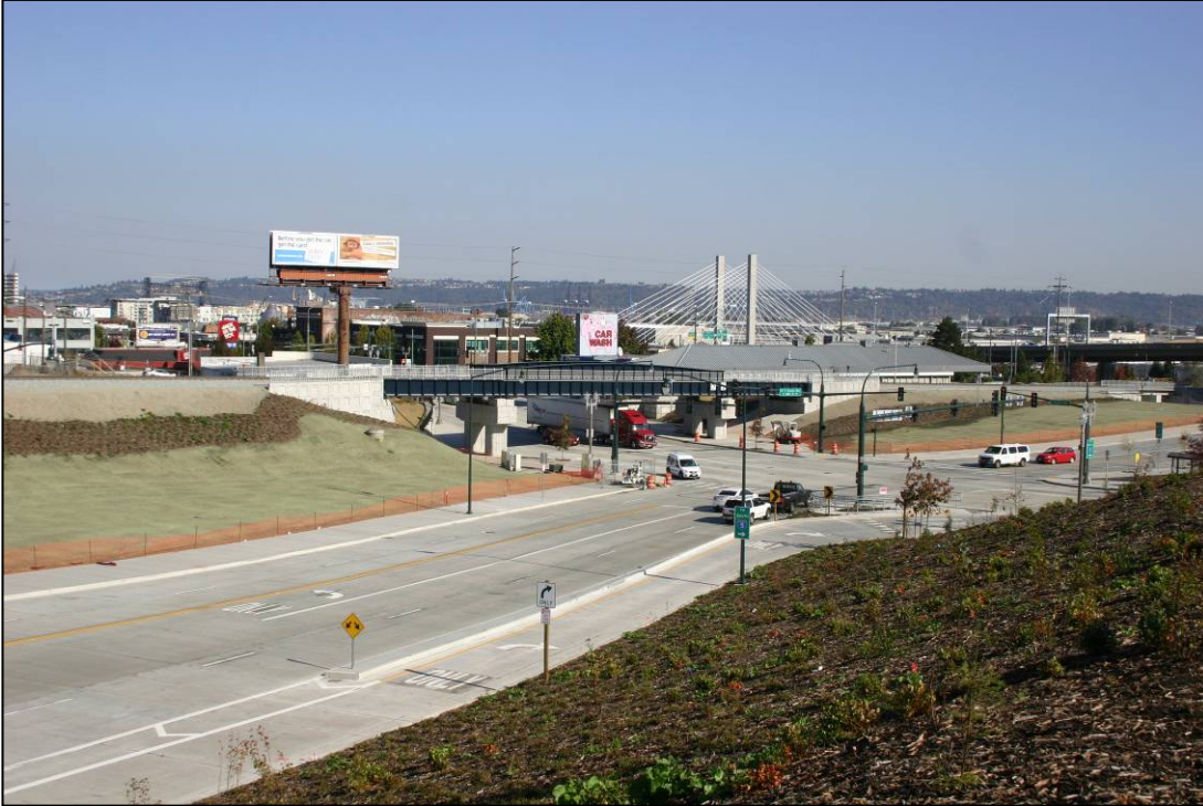
Southwest corner of South Tacoma Way and Pacific Avenue. View of the berm area to the left and right of the Pacific Avenue Underpass. Port of Tacoma in the background.