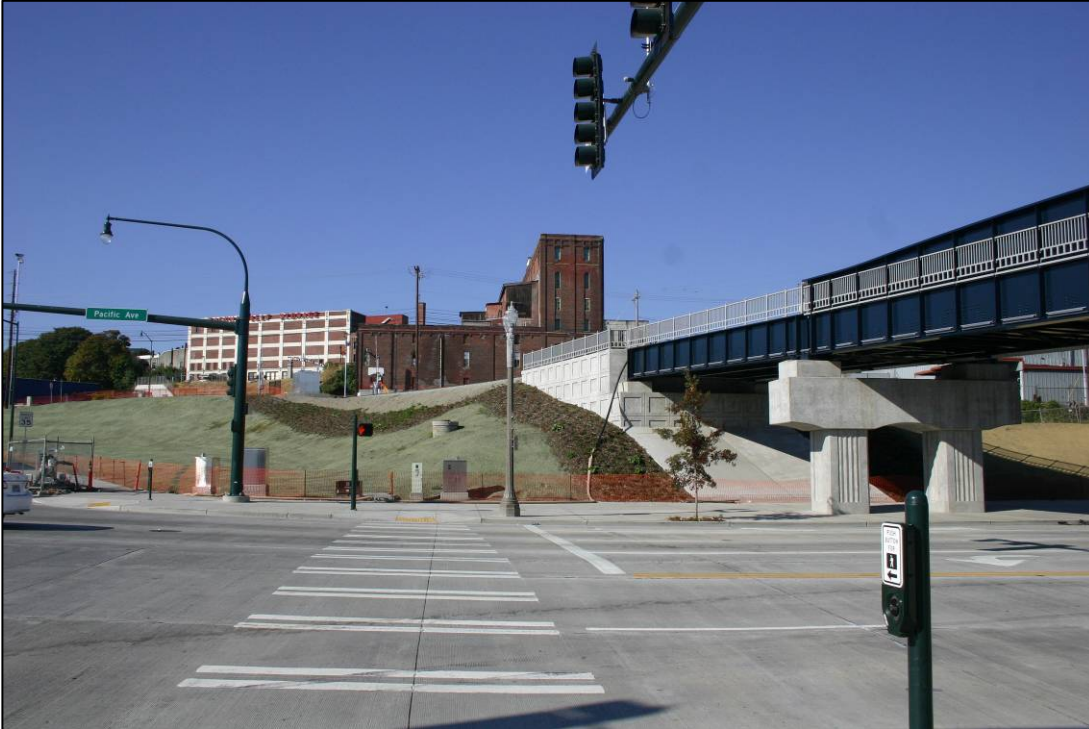
View of the northwest corner of South Tacoma Way and Pacific Avenue, facing west toward the Brewery District. Berm area to the left and Pacific Avenue Underpass to the right.